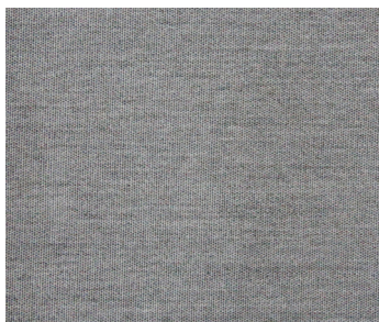
LIGHT GREY Axvision 13737014