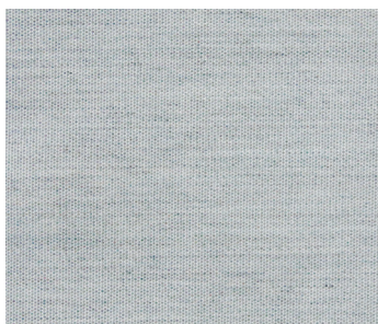
LIGHT BLUE Axvision 13737015