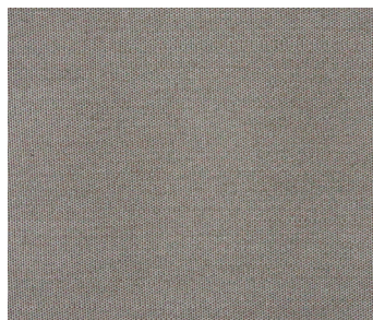
SAND Axvision 13737331